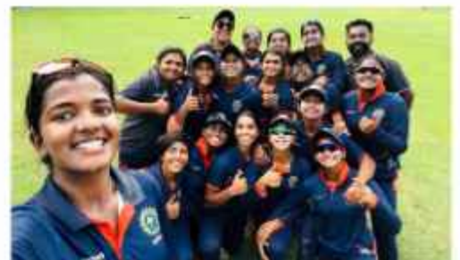
Kerala U-19 Womens Team reached the Knock Outs of U-19 Women's T20 Tournament