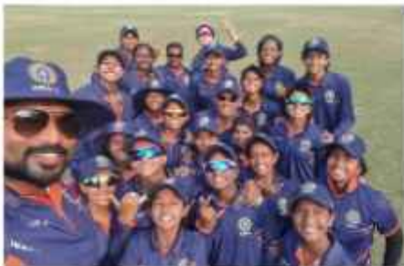
Kerala U 15 womens Team reached the quarter final of U 15 women's Tournament