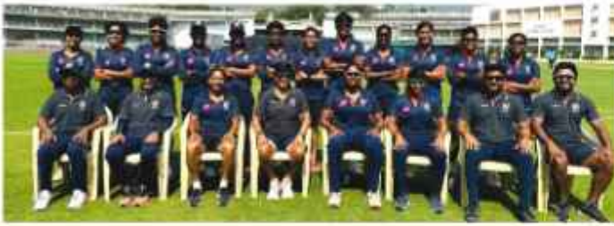
Kerala Senior Women Team reached the Semi Finals of Womens T 20 Tournament