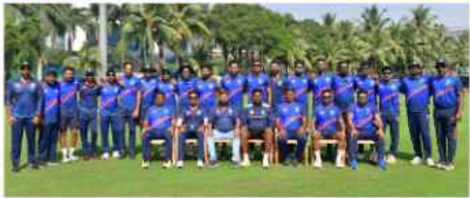
Kerala Senior Men reached the knock out phase of Syed Mushtaq Ali Trophy T 20 Tournament