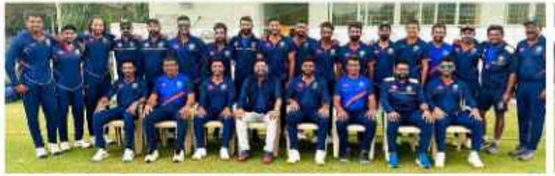
Kerala Senior Men team reached the Quarter finals of Vijay Hazare Trophy Tournament