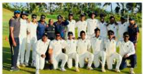
Kerala U 19 boys Team reached the quarter finals of U-19 Cooch Behar Trophy Tournament