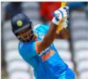
Sanju Samson selected to Indian Team for the series against Ireland